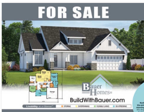
Yard Signs to promote homes!

We offer a wide variety of materials to help you market your homes, such as fliers, brochures, signage, banners, and much more!