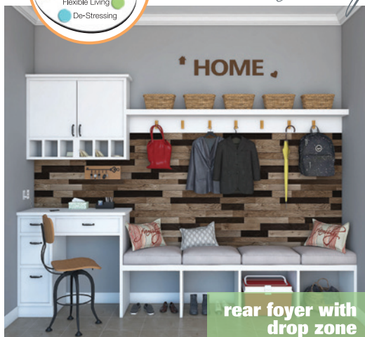
rear foyer with drop zone