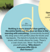
Hidden Asset Circles