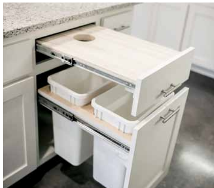
Attention to detail: built-in cutting board/trash/recycle bin