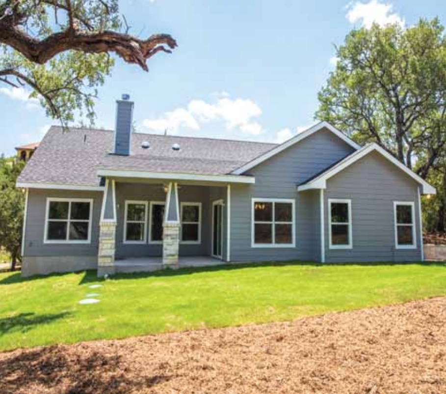
Bonham as built by Aubrey Homes

Darcy chose the Bonham design in part based on the home's curb appeal and dreamy outdoor living spaces, front and back. While the design features multiple windows, Darcy added sun tunnels for increased daylight in the laundry and open entertaining area. In addition, transom windows over the walk-in shower in the owner's suite and the dual sink vanity in the shared hall bath provide even more illumination. There are polished concrete floors throughout, and Darcy substituted a "Costco closet" in lieu of the original design's staircase. The rear foyer entry from the garage turned out beautifully, as did the closet in the owner's suite, which also offered a window over the built in dresser and more than 50 lineal feet of hanging. The Bonham's buyers were a couple with one child still in high school, searching out that perfect home for soon to be empty-nesters. After looking at area production builders' "cookie cutter" homes, they found the Bonham's floor plan to be an ideal fit and had an appreciation for Aubrey Homes' creativity and attention to detail in its construction and design.