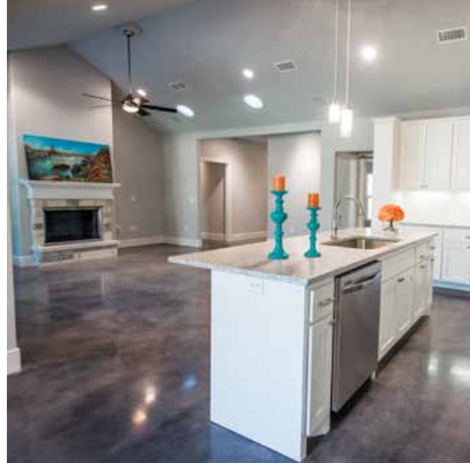
Custom touches: polished concrete floors throughout