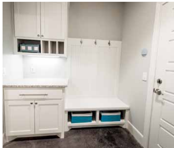
Well thought layout design: rear foyer entry from garage