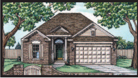
#42222 the Holbrook II | 1434 sq. ft.