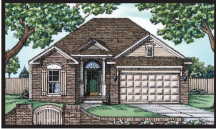
#5180 the Holbrook | 1339 sq. ft.