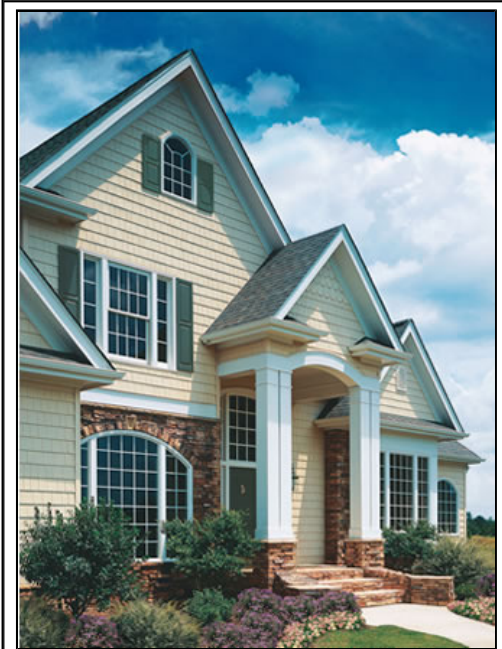
CerainTeed offers the gamut of low-maintenance vinyl siding choices, from value priced options to simulated shakes.