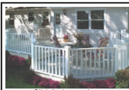
Click for larger view.

Julie recently replaced her old windows with low-maintenance windows that tilt-in for easy cleaning. "I like having things clean and I can clean the new windows four times a year, whereas the older windows only got cleaned in the spring and fall. And I still have more time to get other maintenance tasks done that otherwise wouldn't get done at all."