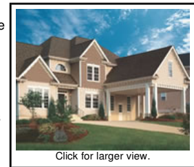
Click for larger view.

The combination of aesthetics, performance and practicality have helped make low-maintenance products an easy decision for buyers and builders alike. Whether the appeal is "easy to clean" or "lifetime warranty," is it any